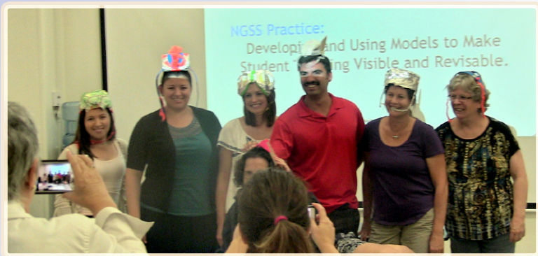
ABC secondary science teachers wear safety helmets they engineered to withstand a six foot fall with a paintball inside.

This was the second year for the ABC STEM (Science, Technology, Engineering, Math) Grant summer training. Fifty two secondary science teachers attended seven days of training at the District Office and Whitney High School from July 23 - July 31. A major focus of the training was on embedding engineering into the teachers' science content based on the Next Generation Science Standards (NGSS). The engineering sessions were provided by faculty from CSULB, CSUSB, and ABC high school science teachers. ▶