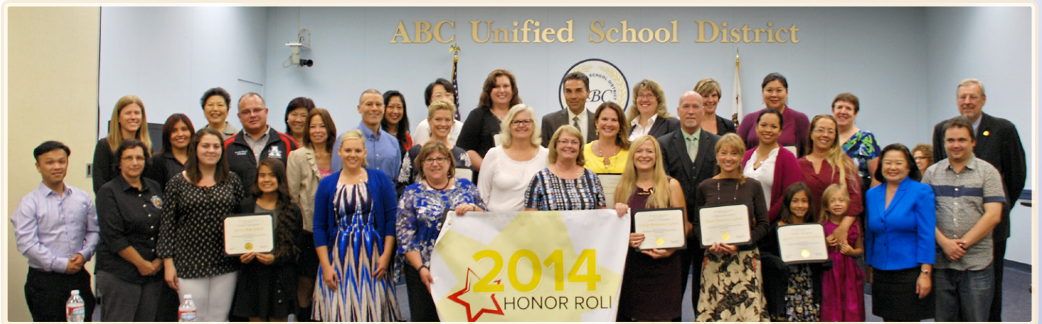
CBEE - STAR Schools: Artesia HS, Bragg ES, Burbank ES, Carver ES, Elliott ES, Gabr HS, Kennedy ES, Nixon ES, Palms ES, Ross MS, Stowers ES, and Tetzlaff MS.