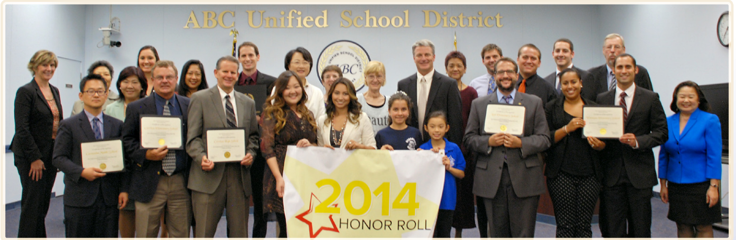
CBEE - SCHOLAR Schools: Carmenita MS, Cerritos ES, Cerritos HS, Gonsalves ES, Leal ES, Whitney HS, and Wittmann ES.