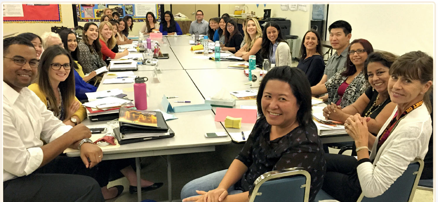
Wellness Coordinators and Support Staff

Welcome Wellness Coordinators and support staff for being a part of ABC to provide added support for our students! ▶