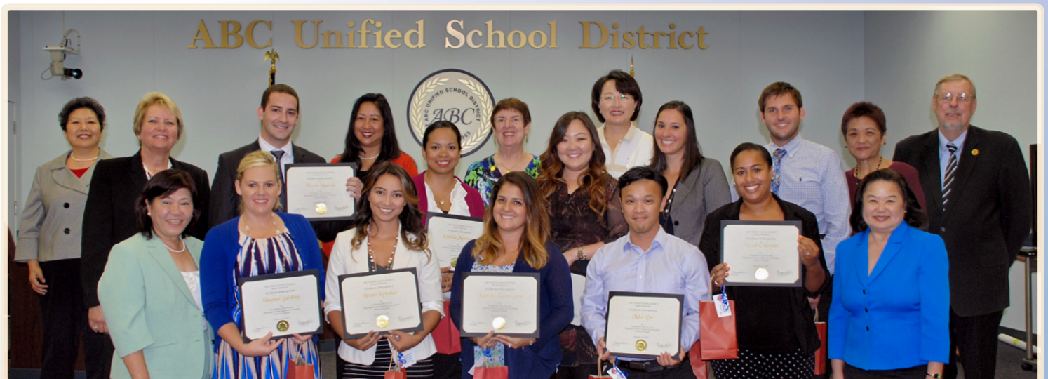
2015 teachers completing the Teacher Induction Program.